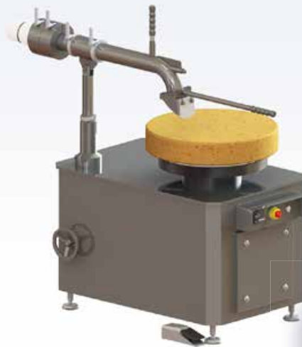
BMR 950 NEW MACHINES - PORTIONING