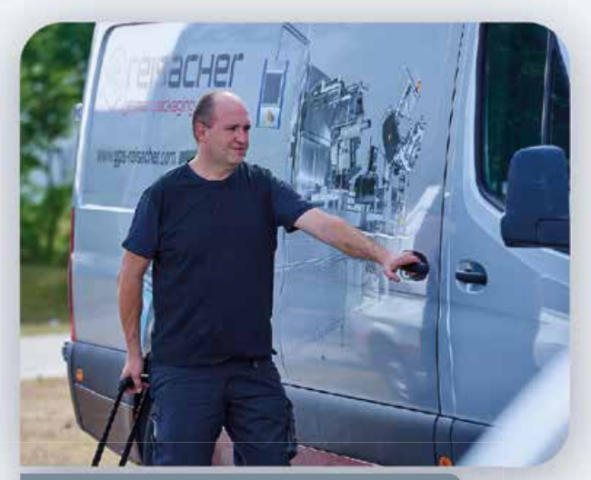
Do you need help? Write to us!