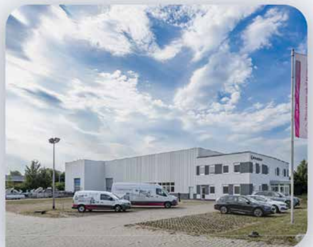
The GPS Reisacher company site in Bad Grönenbach

GPS Reisacher is a globally respected company for new and professionally rebuilt machines in the fields of food processing and packaging solutions. The company location in Bad Grönenbach in the Allgäu region not only serves as a storage, development and production location for the numerous machines and systems. In the meantime, another competence center has been set up with a complete service center and is constantly being expanded. GPS Reisacher supplies all seven continents with solutions for the food processing and packaging. A worldwide maintenance and warranty concept guarantees our customers perfect support even after the purchase. You too can benefit from our comprehensive market knowledge, many years of experience and the high-tech know-how of our qualified employees.